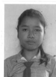
B. Thongni Signature

Tick (✓) in the box provided if candidate wishes to appear in all the subjects as Non-Regular.