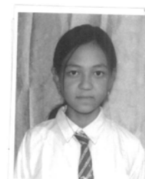
D. Nongrem Signature of the candidate

Tick (✓) in the box provided if candidate wishes to appear in all the subjects as Non-Regular.