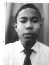
Mingnam Mk. Signature of the candidate

Tick (✓) in the box provided if candidate wishes to appear in all the subjects as Non-Regular.