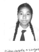
Bidan chagesa m sangma

Tick (✓) in the box provided if candidate wishes to appear in all the subjects as Non-Regular.