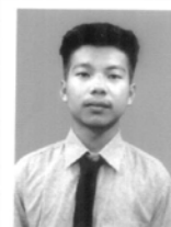
Nikcham ch momin

Tick (✓) in the box provided if candidate wishes to appear in all the subjects as Non-Regular.