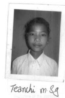
Teanchi m. Sg

Tick (✓) in the box provided if candidate wishes to appear in all the subjects as Non-Regular.