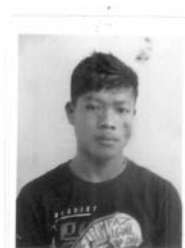
Terangstar ch. Marak

Tick (✓) in the box provided if candidate wishes to appear in all the subjects as Non-Regular.