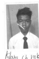
Kilam ch mk

Tick (✓) in the box provided if candidate wishes to appear in all the subjects as Non-Regular.