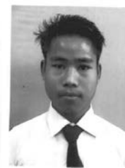
Techiom .m. marak

Tick (✓) in the box provided if candidate wishes to appear in all the subjects as Non-Regular.