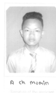
A ch momin Signature of the applicant

Tick (✓) in the box provided if candidate wishes to appear in all the subjects as Non-Regular.