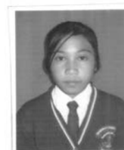
R. Lyngkhoi Signature of the applicant

Tick (✓) in the box provided if candidate wishes to appear in all the subjects as Non-Regular.