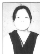
R CH. M

IMPORTANT: Back page of this NON-REGULAR form should be printed, and signed by all concern before submitting to the Board.