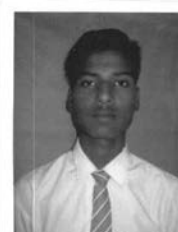
Suresh Basfor Signature of the applicant

Tick (✓) in the box provided if candidate wishes to appear in all the subjects as Non-Regular.