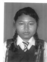
Dikatchi ch. mk

Tick (✓) in the box provided if candidate wishes to appear in all the subjects as Non-Regular.