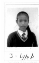
J - Lytep

Tick (✓) in the box provided if candidate wishes to appear in all the subjects as Non-Regular.