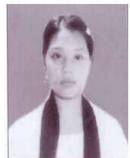
Gunchira mikkime marak

N.B: If there is any minor mistake in the above particulars, candidates is required to correct with red ball point pen.